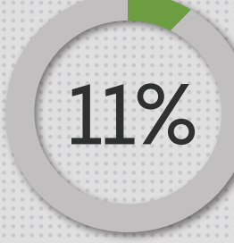
11% of youth have a mood disorder

20% of youth ages 13-18 live with a mental health condition