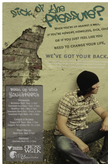
YOUTHREACH poster and flyers for distribution where street youth congregate in Spokane and N. Idaho

opportunities and supports necessary for them to leave the streets, access needed services and find safe housing.